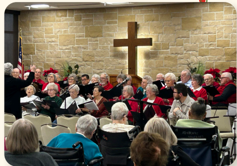
Fairhaven Choir at Christmas Service