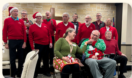
Barbershop Ensemble at Christmas Dinner