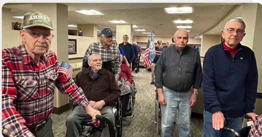
Entering into the Chapel with their Branch