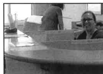
Temp. 2nd Floor Nurses Station