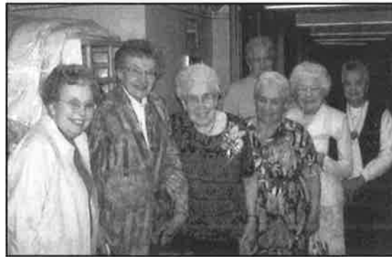
2004 Florences' 100th Birthday