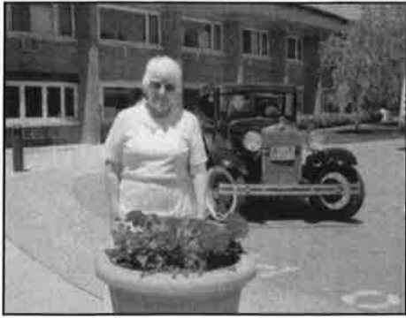
2003 Antique Car Show

A short look back at the fun and creative fellowship over the last 17 years.