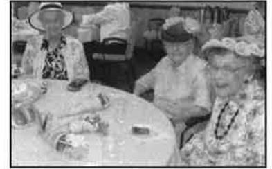
2017 Ladies Tea Hat Day