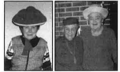
2000 Ladies Hat Day