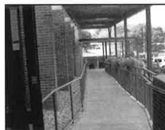
Health Center Sliding Door