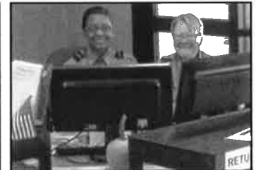
Changing of the Guard