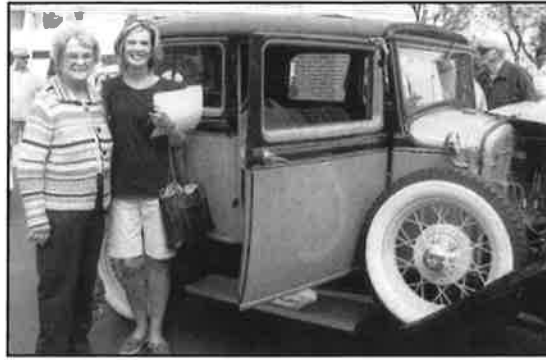
2017 Antique Car Show