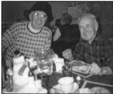
2000 Men on Hat Day