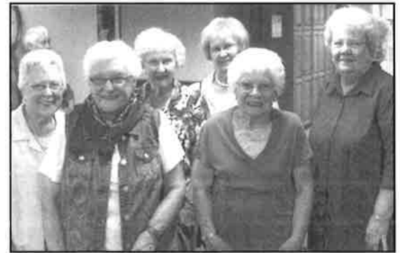
2017 Fairlaner Family Friends