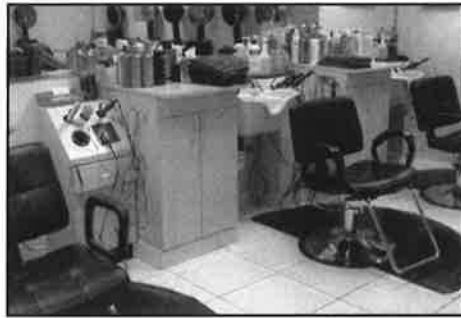
2017 Current Beauty Shop