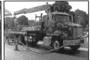
Truckloads of Materials