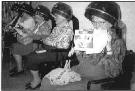
2000 Beauty Shop Then