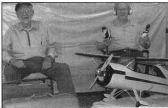
2017 Men's Steak Fry - Airplane Theme