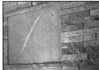
Front Entry Wall

The Fairhaven Board of Directors approved a project in 2017 to update the Main Entry and Health Center Entry along with new decore and some utilization adjustments. It will be exciting to welcome family and friends in 2018 as we celebrate 50 years of service with these "First Impression" improvements! (see enclosed letter)