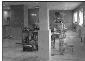
"Welcome Inn" Preparation