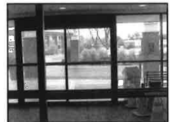
New Front Entry Doors